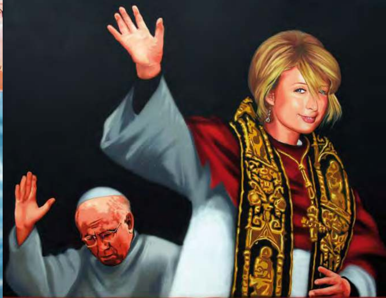
> Touched by the Hand of God , 2007, spray enamel and oil paint on aluminium, 180 x 180cm