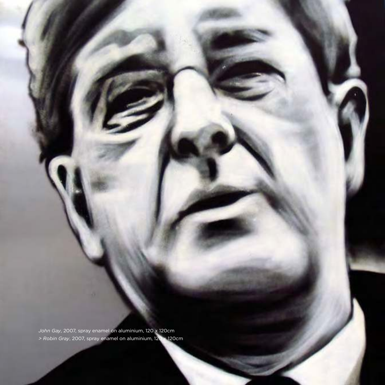
John Gay , 2007, spray enamel on aluminium, 120 x 120cm