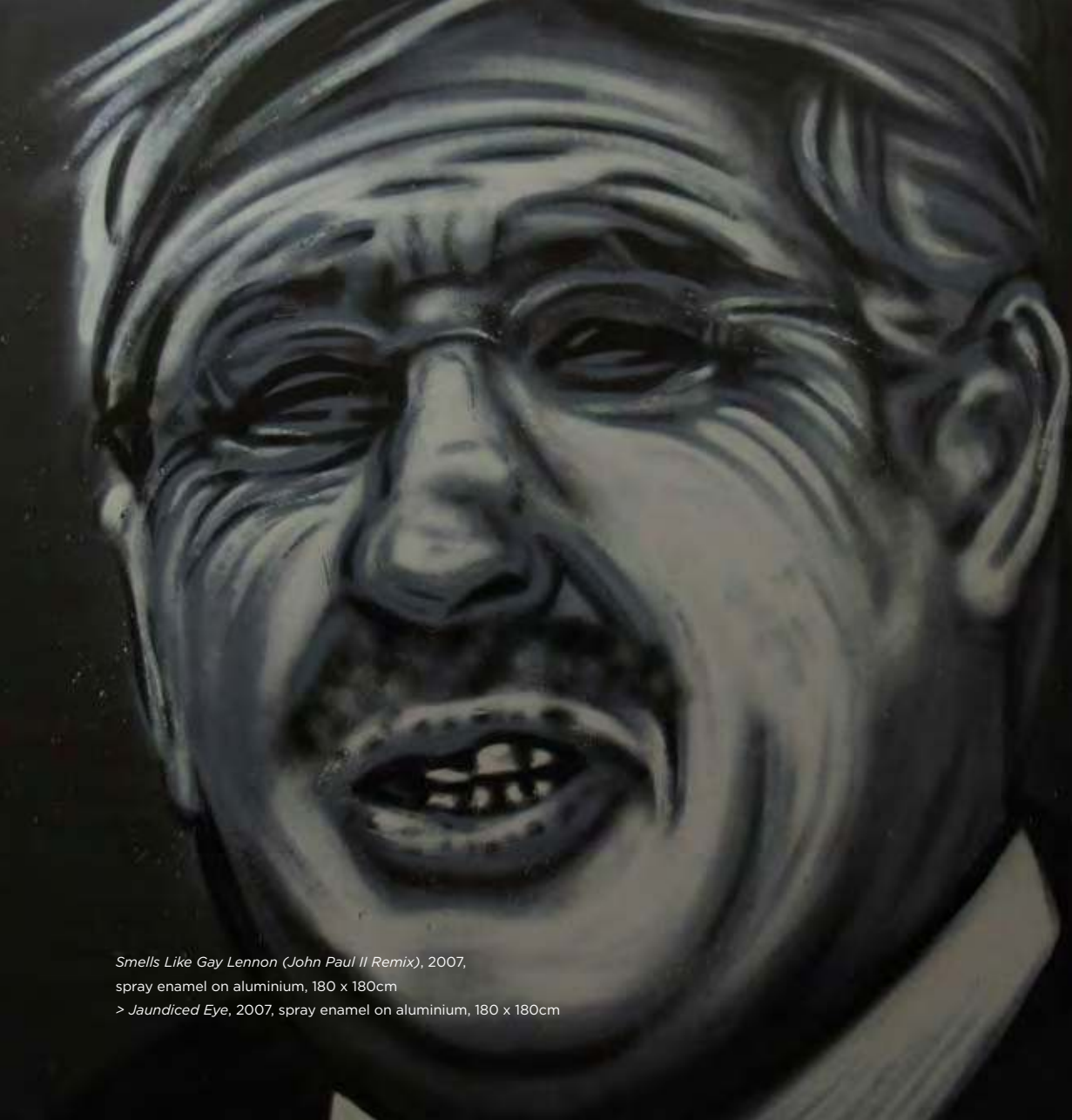
Smells Like Gay Lennon (John Paul II Remix), 2007, spray enamel on aluminium, 180 x 180cm

> Jaundiced Eye, 2007, spray enamel on aluminium, 180 x 180cm