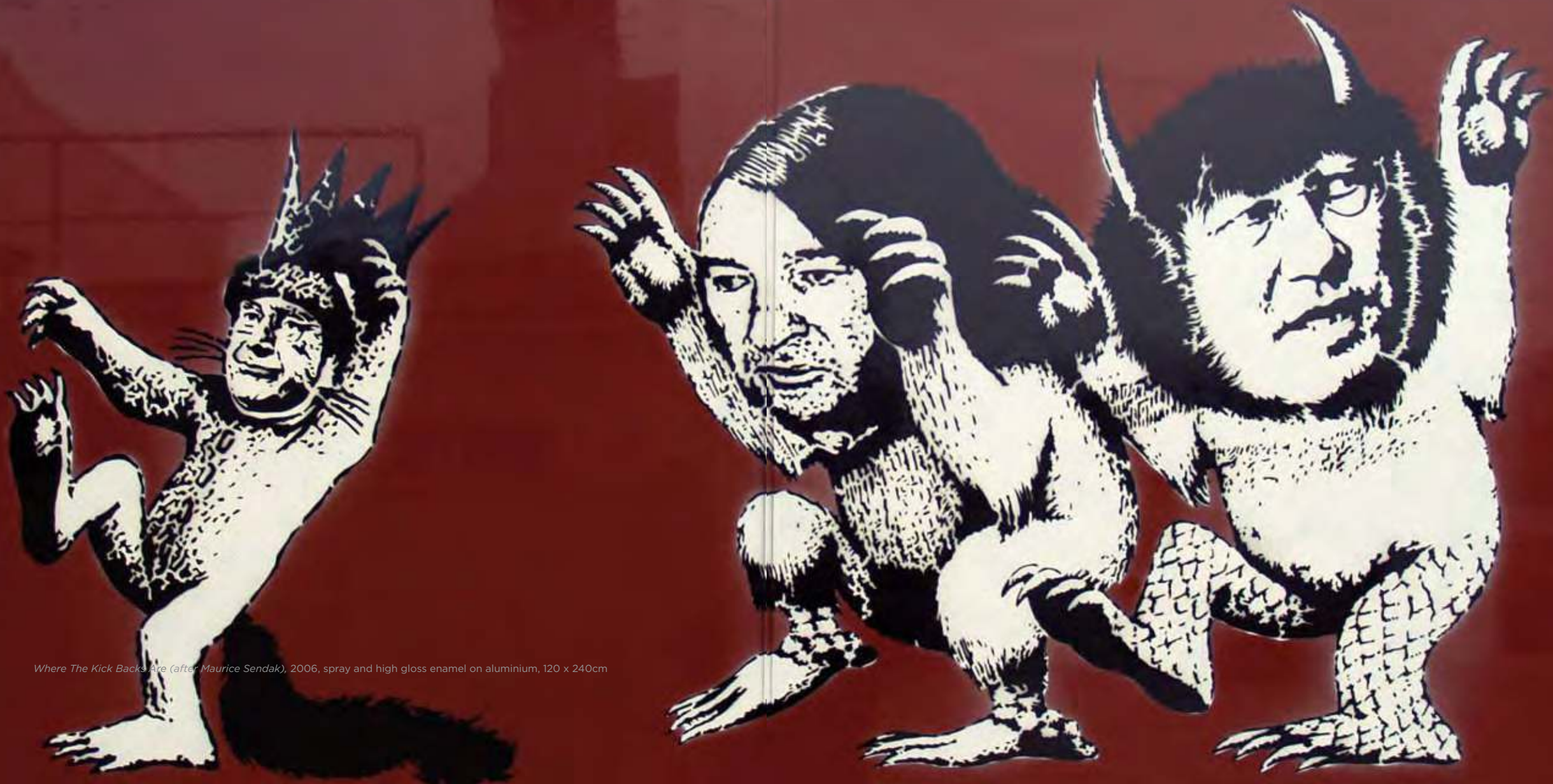
Where The Kick Backs Are (after Maurice Sendak), 2006, spray and high gloss enamel on aluminium, 120 x 240cm