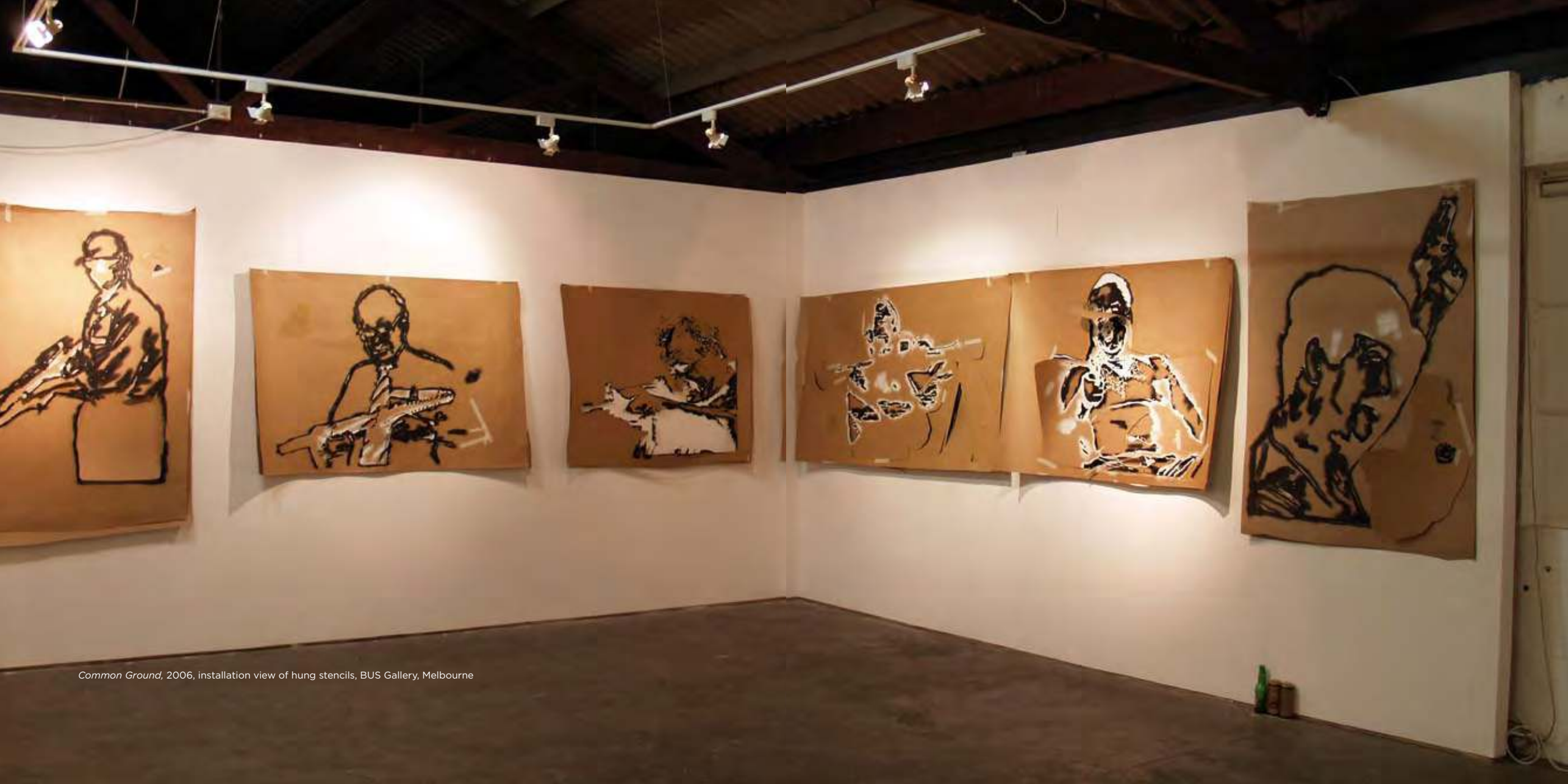
Common Ground , 2006, installation view of hung stencils, BUS Gallery, Melbourne