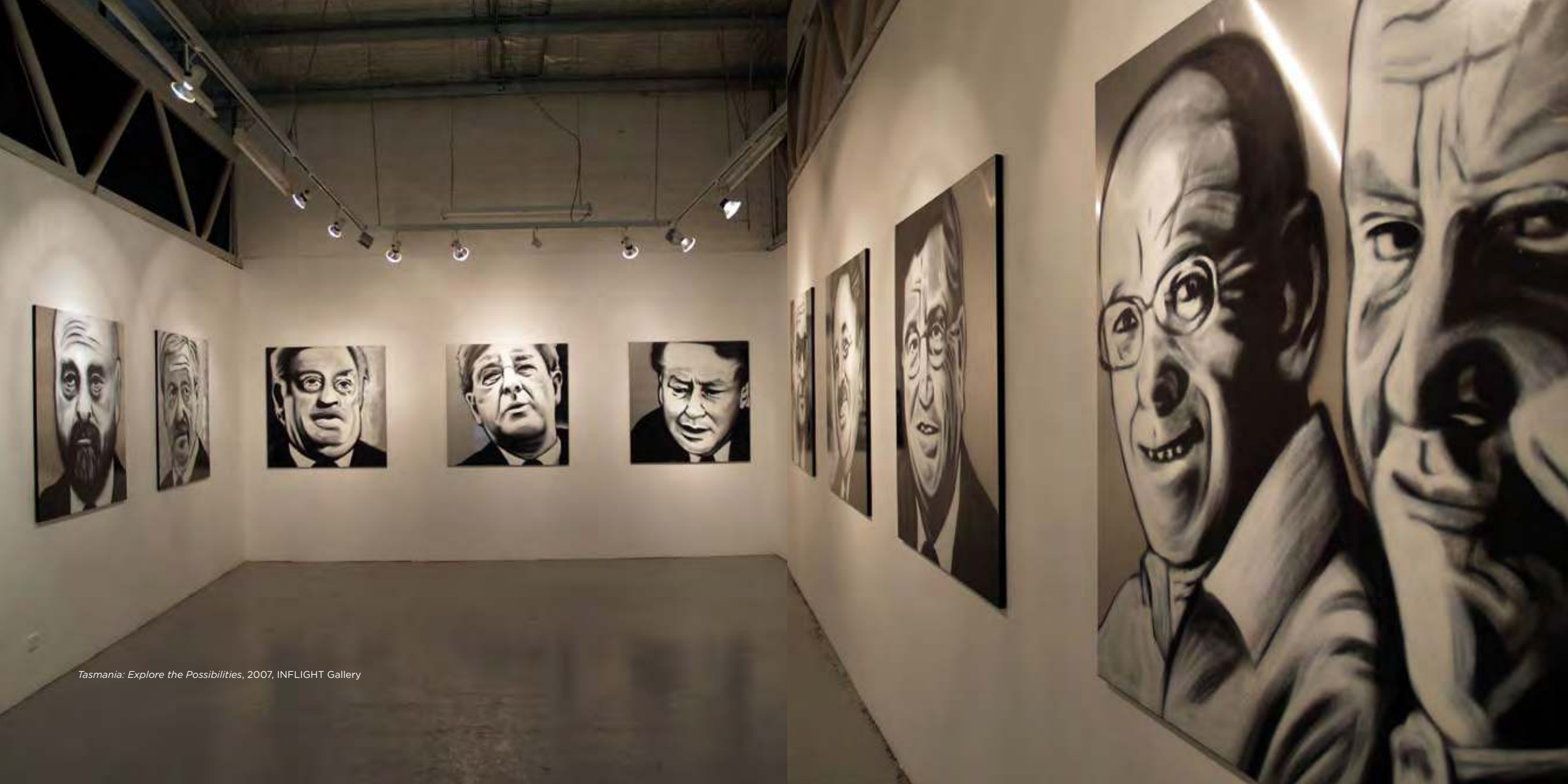
Tasmania: Explore the Possibilities, 2007, INFLIGHT Gallery