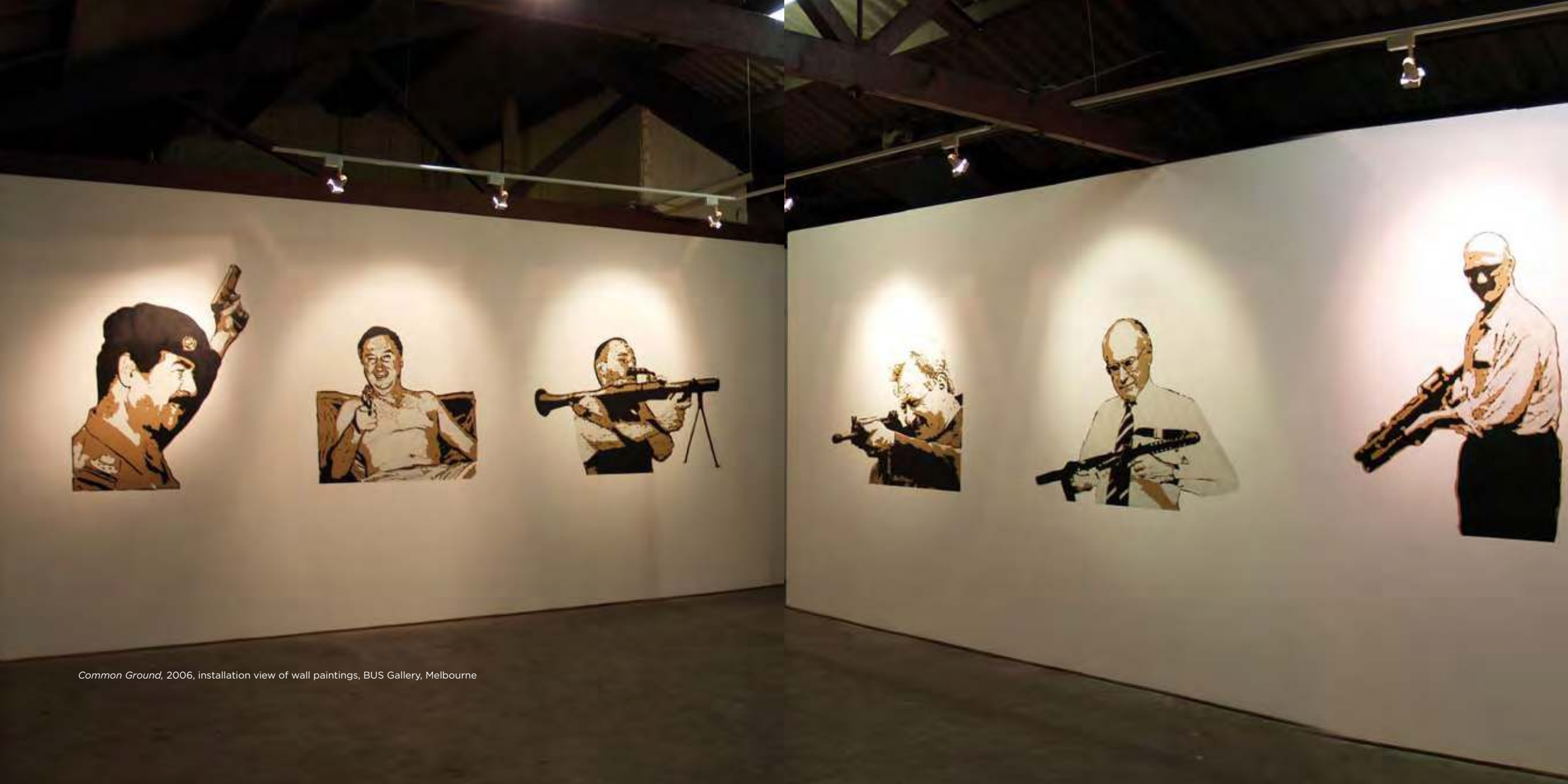
Common Ground , 2006, installation view of wall paintings, BUS Gallery, Melbourne