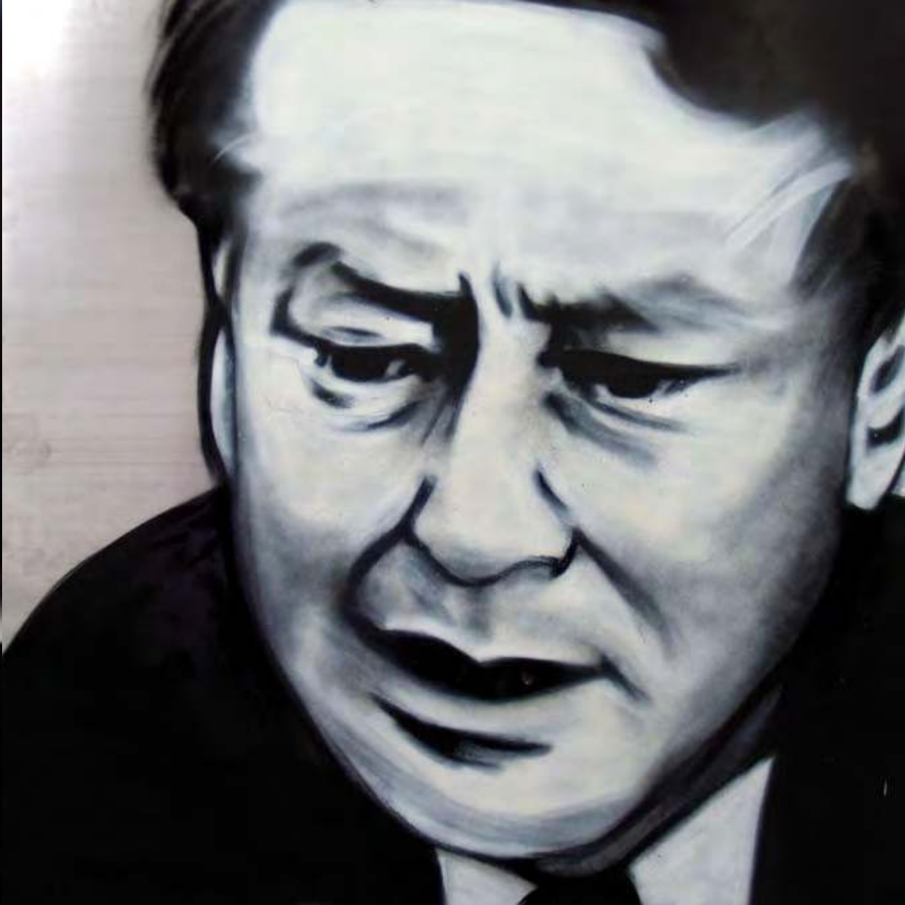
> Robin Gray , 2007, spray enamel on aluminium, 120 x 120cm