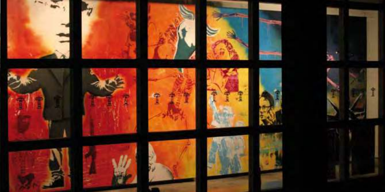
Dissent Disrupt Desert , 2004, Die Laughing Collective (Jamin, Paicey & Empire) spray enamel and household paints on MDF, 240 x 1200cm Installation views from opening night with Hobart band The Scandal performing in space