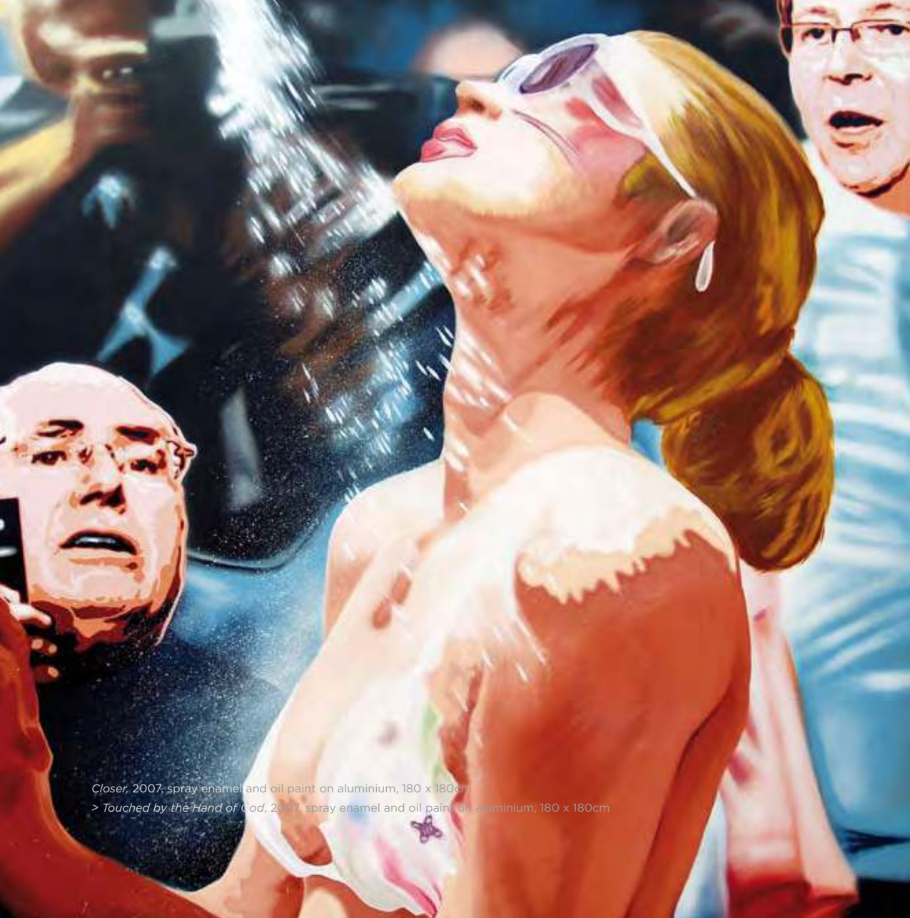
Closer , 2007, spray enamel and oil paint on aluminium, 180 x 180cm