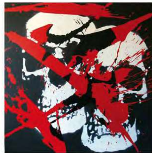
Sedition , 2005, synthetic polymer and spray & high gloss enamel paint on MDF, 6 components: 240 x 360cm (overall)