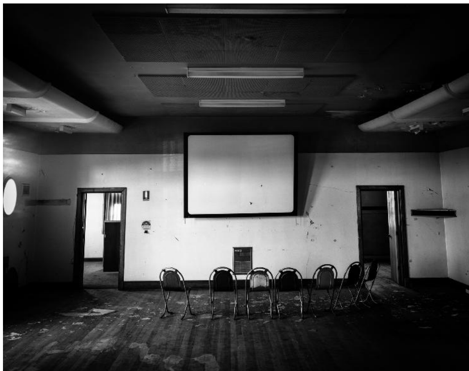
Pulp Office, 2016