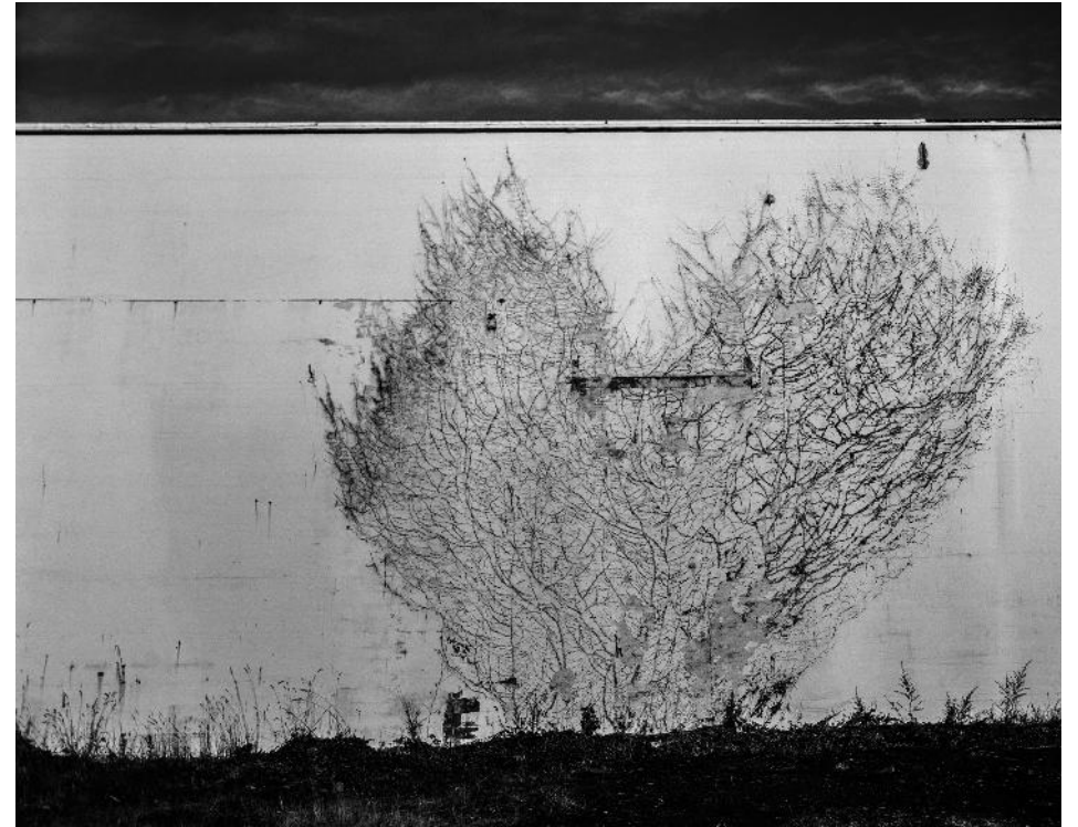
Ivy Wall, 2016

American photographer Roger Ballen who has been living in South Africa for the past thirty years, made a series of photographs titled 'Platteland'. The majority of photographs represent country people who spend most of their time in their homes. Ballen was curious about their lives as white South Africans who were literally hiding in their homes. He wanted to learn more about them and what went on behind their closed doors so, equipped with a camera, he