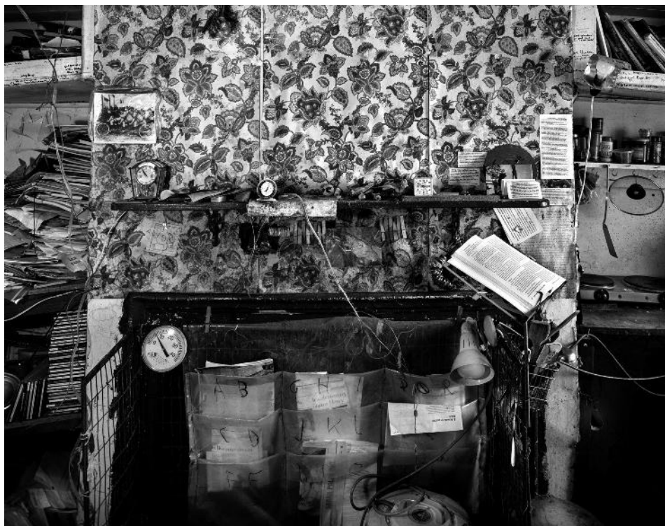
Fred's Fireplace, 2016