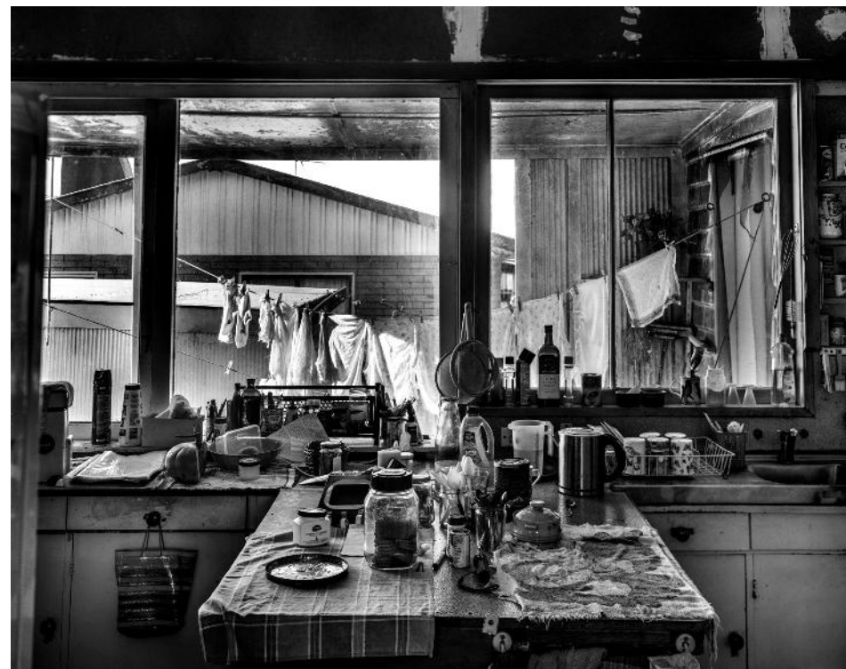
Freddy and Gwen's Table, 2016