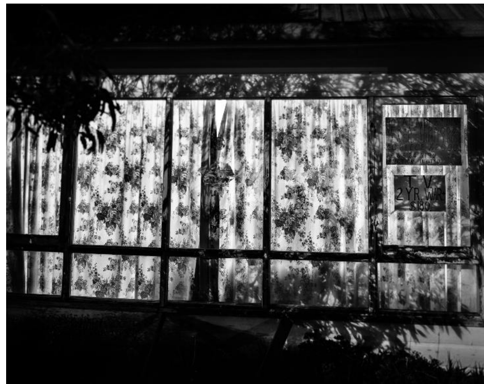
Freddy and Gwen Night, 2016