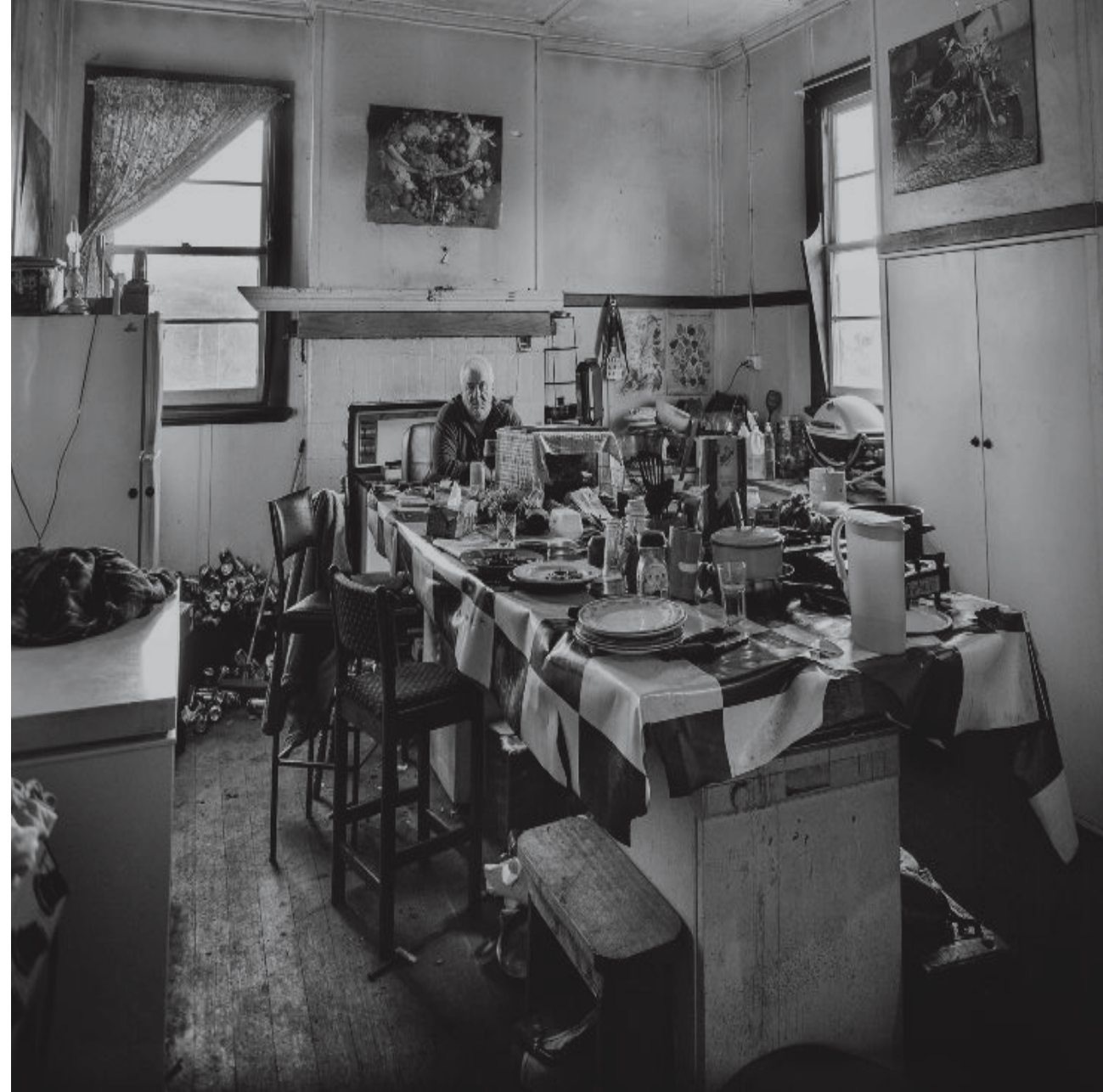
Mick's Kitchen, 2016