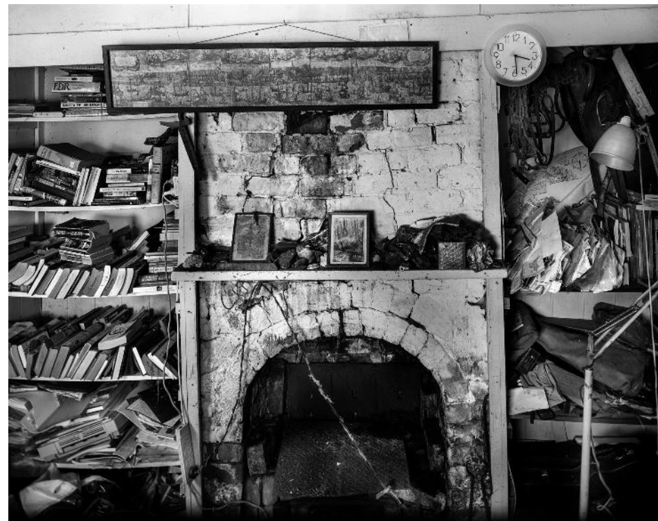
Fred's Wall, 2016