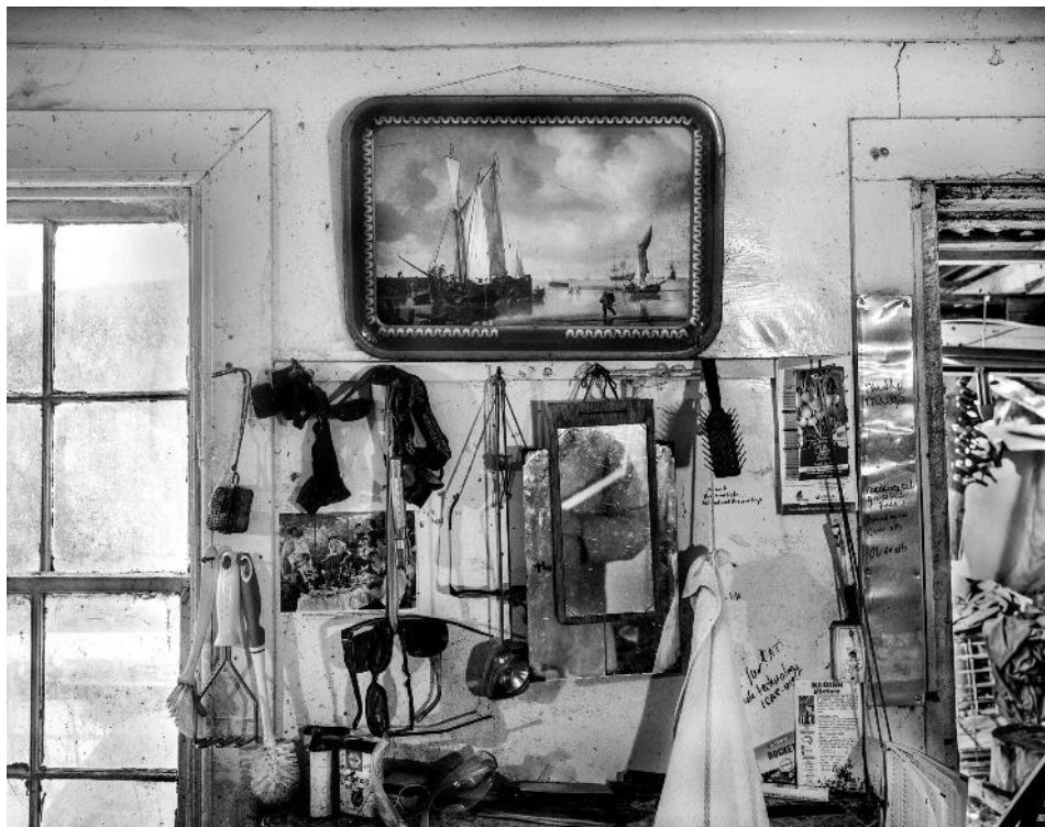
Fred's Kitchen, 2016