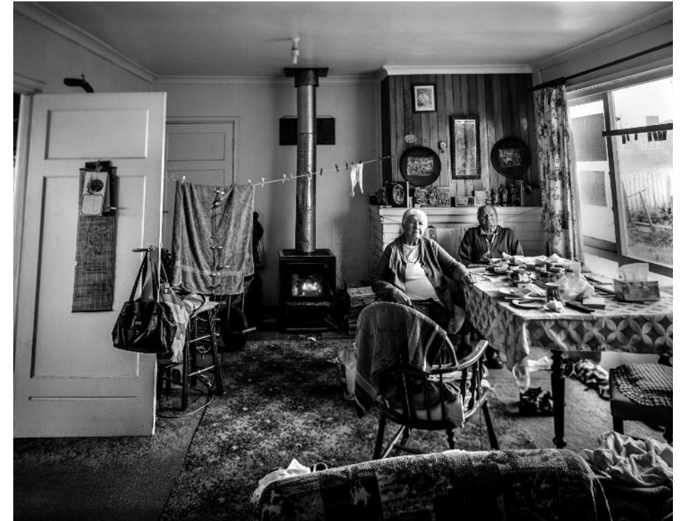
Freddy and Gwen, 2016

The photograph that resulted from this encounter, titled 'Freddy and Gwen', is a seemingly straightforward image of a couple in their living room, yet it is a complex work and is explored