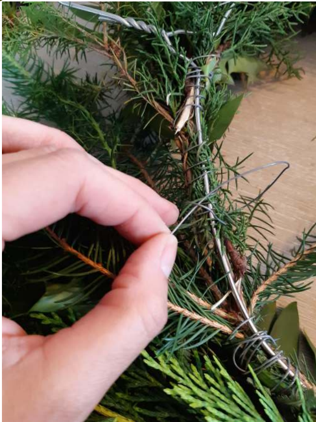
Tying the wire off