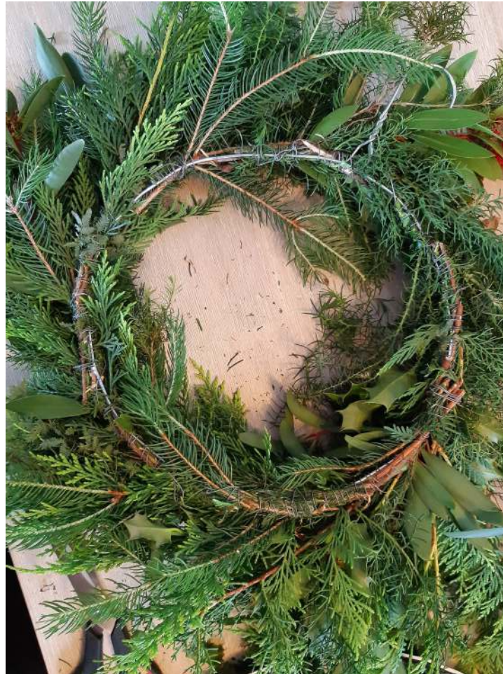
My wreath viewed from the back.

When you have added your last bunch of foliage, tie a tight knot in your wire a few times to hold it in place and stop it unravelling.