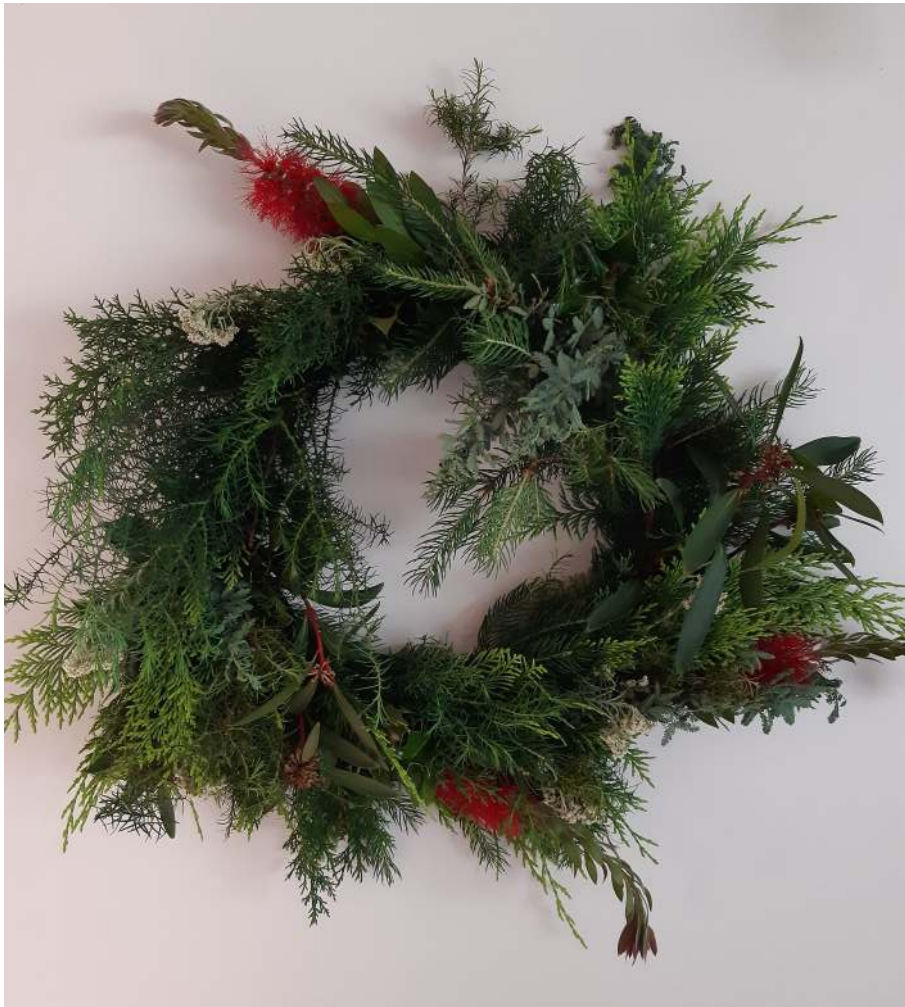
My completed Christmas wreath.