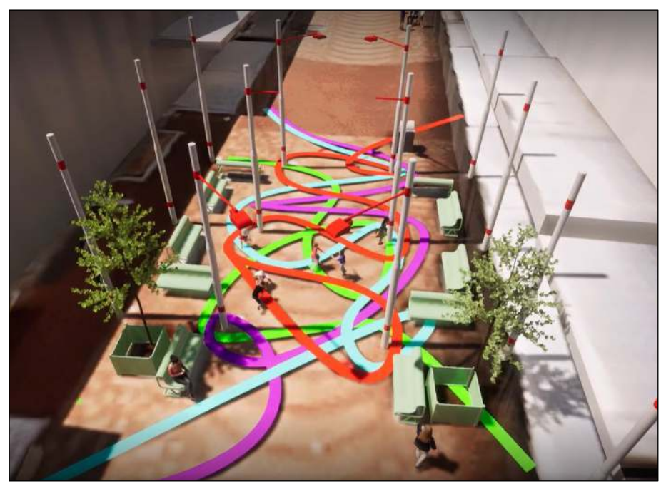
Indication of location

The size of the area is approximately 200 Square Metres, within the boundaries of a 20mt x 10mt rectangle. Please be aware, objects such as seats and planter boxes will be in the same location.