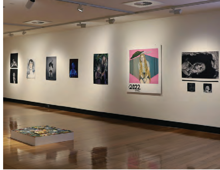
Image: Women's Art Prize Tasmania 2024 Finalists & Presenting Partners

The 2024 prize includes the following categories: $10,000 lutruwita Prize - presented by Rio Tinto Bell Bay Aluminium, $10,000 Women's Art Prize Tasmania - presented by RANT Arts, $5,000 Early Career Artist Prize - presented by Tailored Services for the Arts and $2,000 People's Choice Award - presented jointly by Madeline Gordon Gallery and Project Gallery 90.