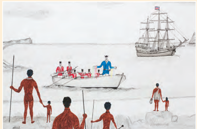
Image: Rex Greeno, Meeting a local tribe in Adventure Bay , mixed media on paper.

REX GREENO: Memories through Sea Stories is a multi venue project from the Tasmanian Museum and Art Gallery.