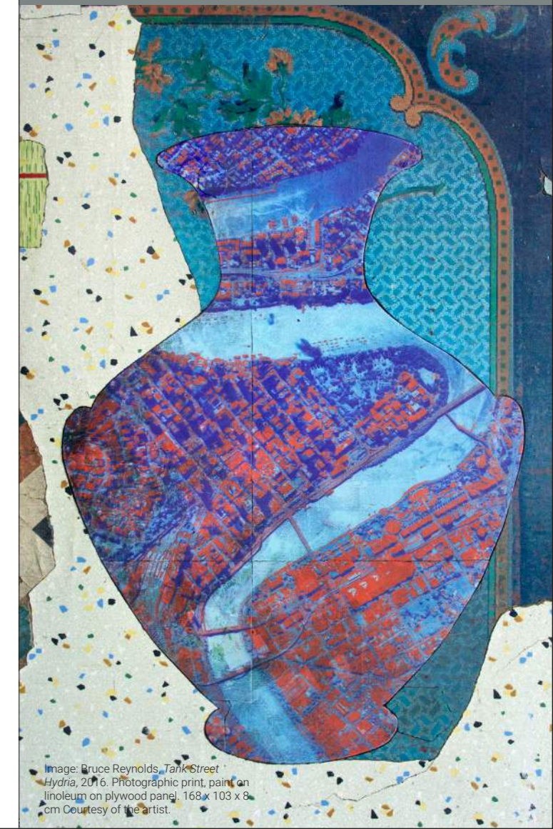
Image: Bruce Reynolds, Tank Street Hydra , 2016. Photographic print, paint on linoleum on plywood panel. 168 x 103 x 8 cm. Courtesy of the artist.